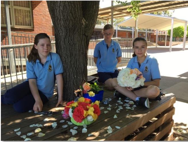
Preparing for Remembrance Day 2016