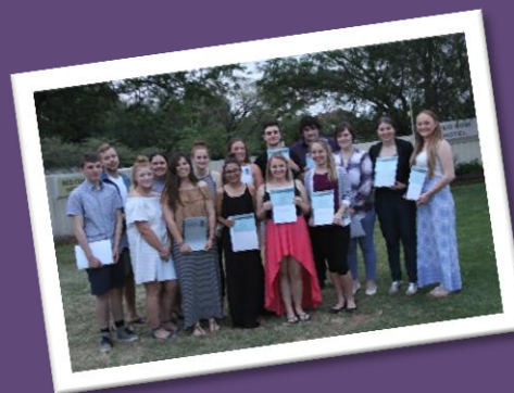
Farewell Year 12 2016!