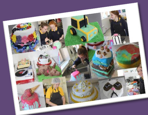
Junee Show Cake Creations