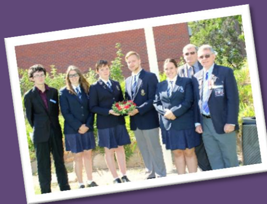
Anzac Day 2016 Junee High School