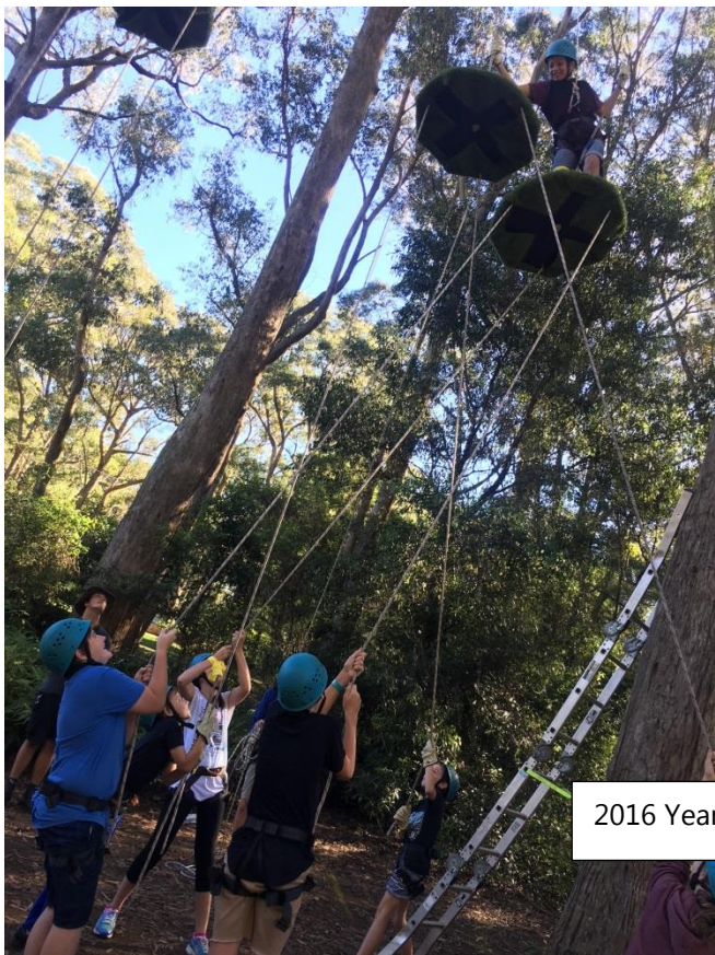
2016 Year 7 Camp experiences