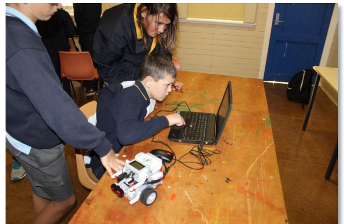
Robotics Program Junee Public School

Each student from the high school paired up with a group of primary students and took them through everything from how to get the robot to move to how to make it follow a line.