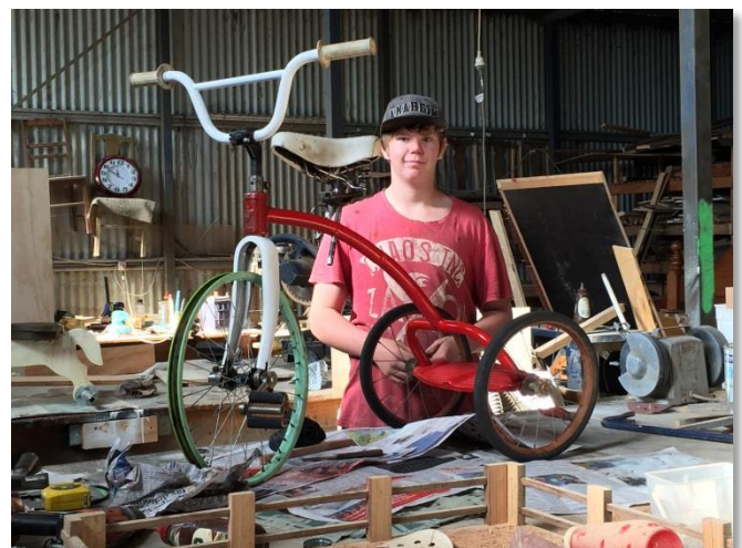
Men's Shed project work