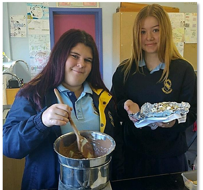
Volcano making in Science