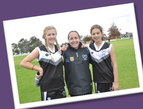
Riverina representatives u15s Girls AFL (and coach)