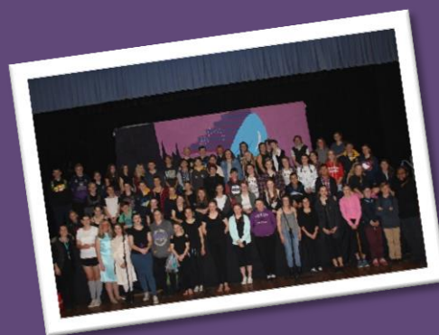
A Grimm Tale at Junee High School!