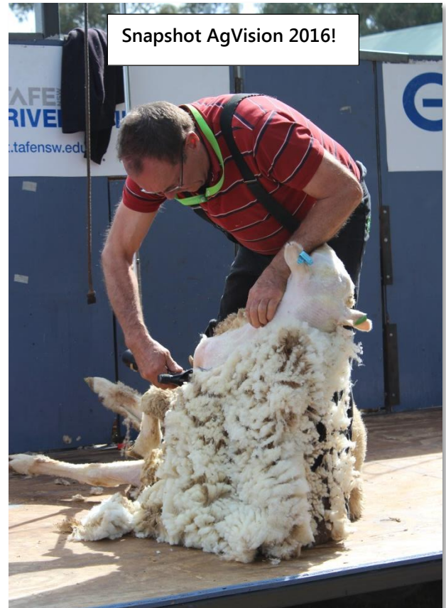
Snapshot AgVision 2016!