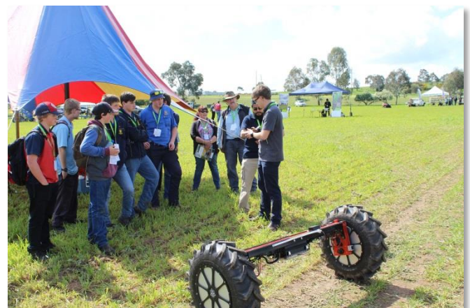
Snapshot AgVision 2016!