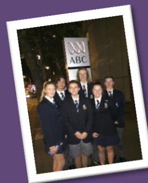
Captains attending Q&A in Sydney