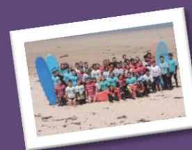
2017 Surf Trip

Junee High School Presentation Night Tuesday 12 December 7pm