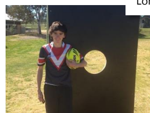
Pass the ball competition winner