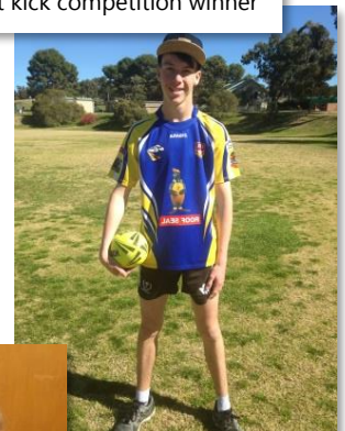
Longest kick competition winner