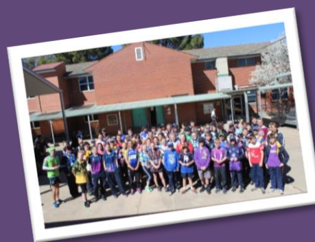
JHS students dressed in footy colours for a cause