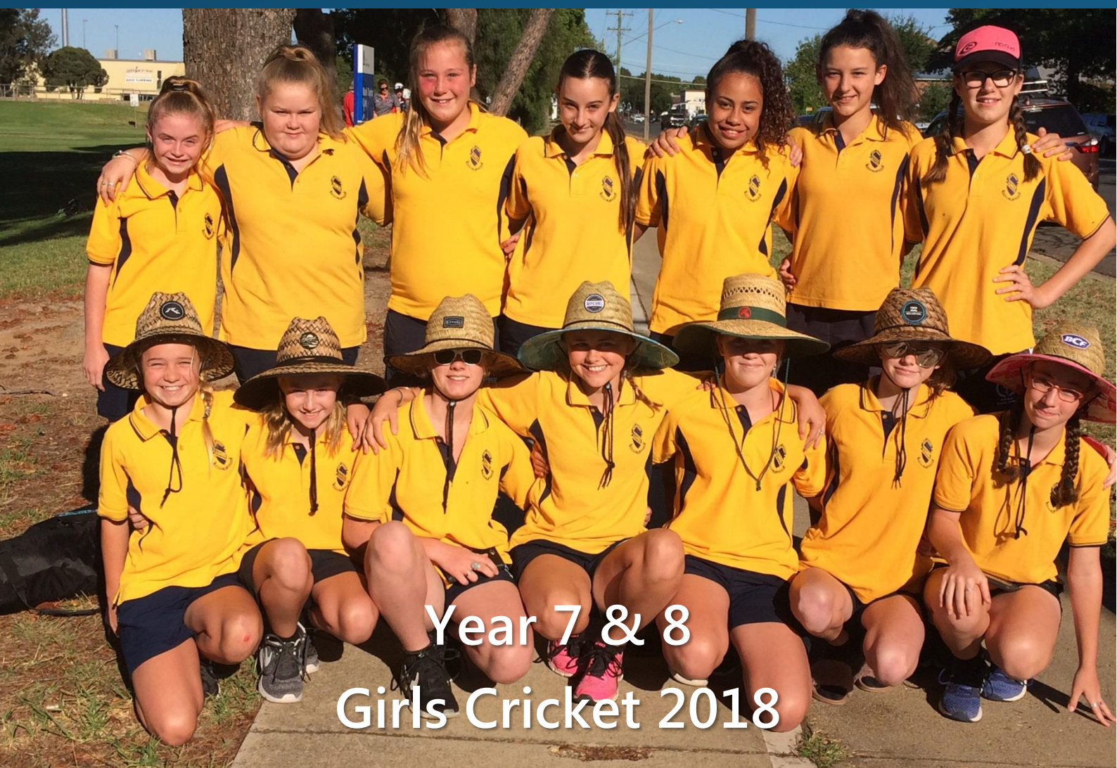
Year 7 & 8 Girls Cricket 2018