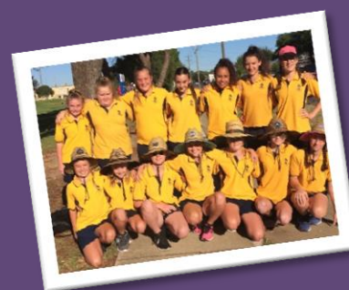
Year 7 & 8 Girls Cricket Team represent JHS in Wagga.