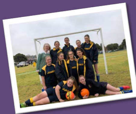
Bill Turner Cup 2018