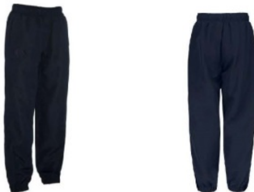
Track Pants – Navy Blue - Cost - $45.00

The P&C wish to advise that they are placing a once only order for 2018 of Canterbury Navy Track Pants (without noticeable branding) as part of the school uniform on Friday 1 June 2018. They are comfortable and warm with elastic cuff and zipper at ankle. If you require a pair please complete the order form and return to the office in an envelope with the money.