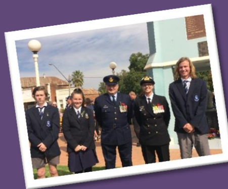
Anzac Day 2018.