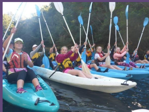
Year 7 Camp 2018