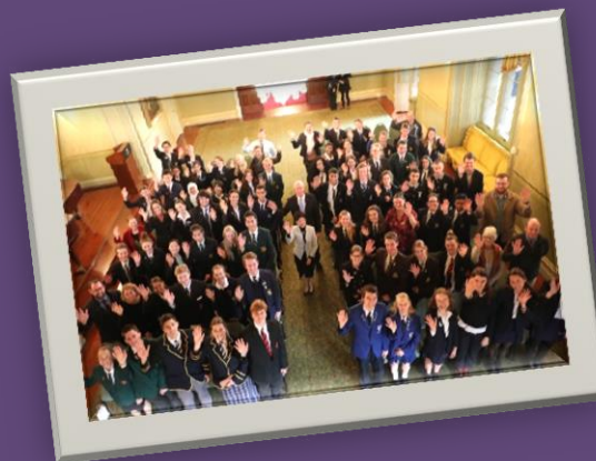
JHS Captains head to Sydney to meet the Governor General at Parliament House