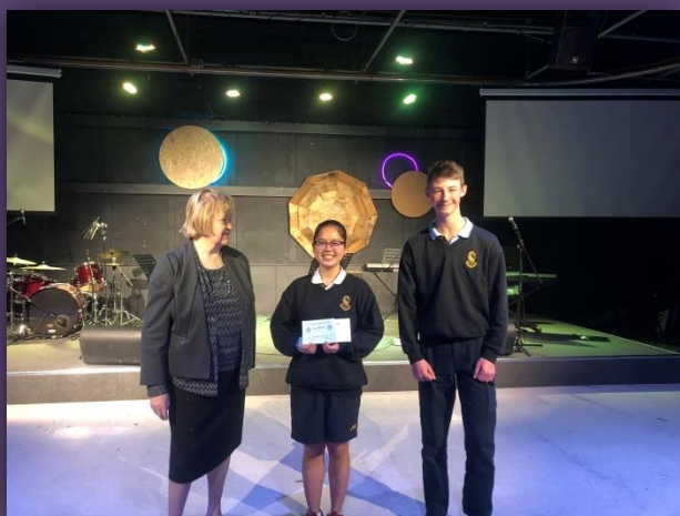
Wagga Wagga Music Eisteddfod Duo Winners