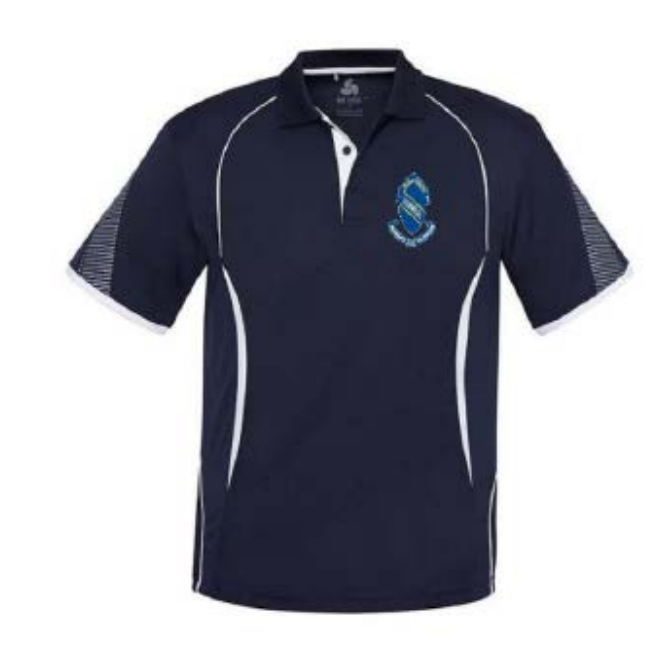
Junior Shirt – Five days a week (no yellow sport shirt)