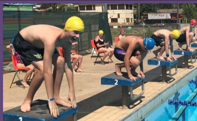
2020 Swimming Carnival