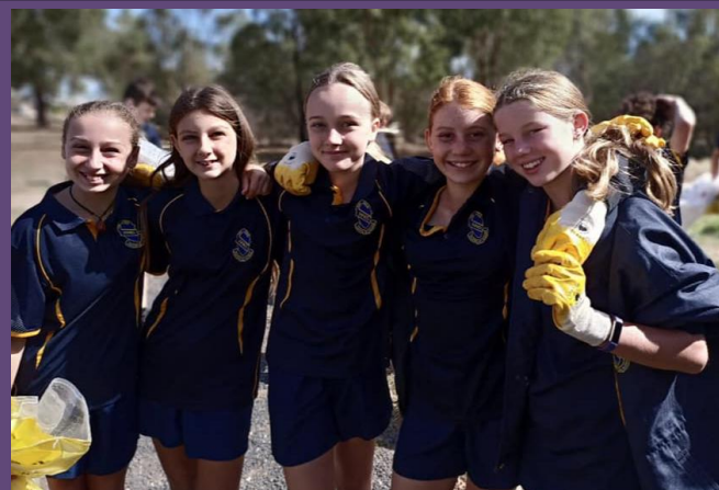
Clean Up Australia, Year 7 at the Wetlands