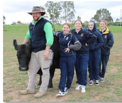
Year 11 Ag students inspecting Ma for mastitis.