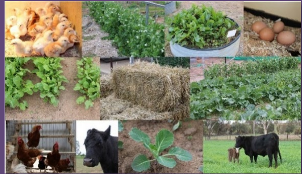
JHS Farm in full production