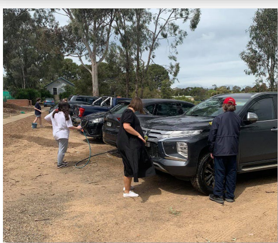
Car Wash Fundraiser