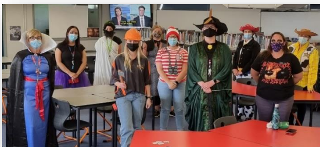
19 Staff looked amazing for the Book Week dress up, held Friday 29 October.