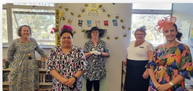
Fashions on the field fun.