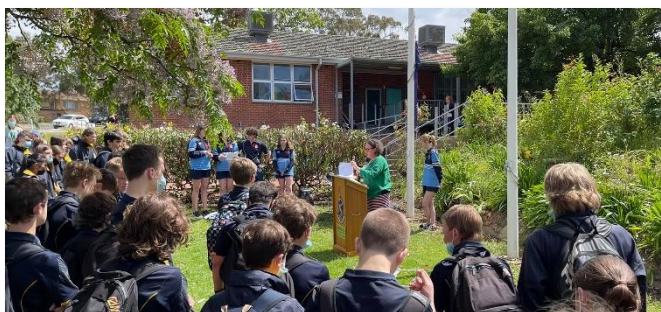
Remembrance Day Ceremony held Thursday 11 November 2021