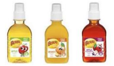
Apple, Orange & Apple Blackcurrant Juice 250ml $2.00