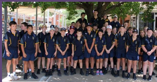
Junee Highs 2021 Year 7 Students