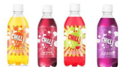
Orange Passio • Raspberry • Blackcurrant • Watermelon Chilli I Sparking Juice $2.00