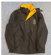
Winter Jacket $65.00

If you would like to order, please return this form with payment details provided on the back before Friday 19 March