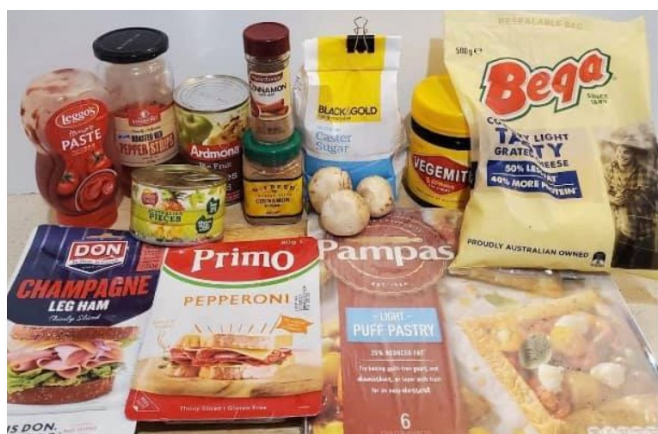
Scrolls are an easy to make snack that can be great for breakfast, as a lunch box filler or as an afternoon treat.